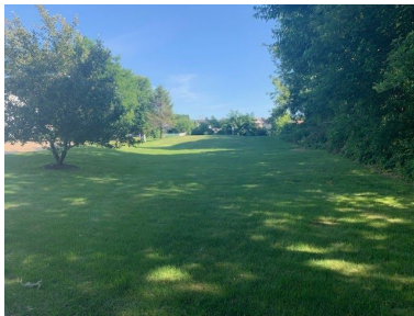
Side Yard (leads to pond)