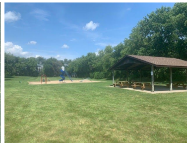
Park in Kitty-Corner Lot (also has baseball field)